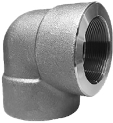
* Reference photo