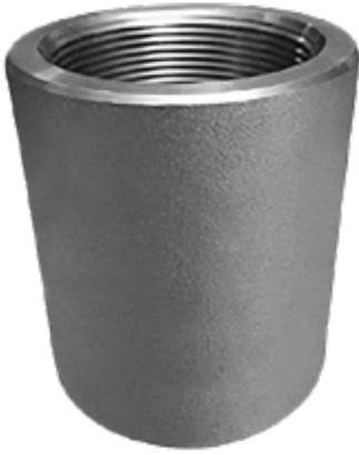
* Reference photo

Design: ANSI B16.11 Threaded: NPT ANSI B1.20.1 Material: Forged Steel ASTM A105 Class: 3000 Correlation: Schedule 160