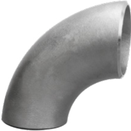
* Reference photo

Material: ASTM A403 316L Design: ASME / ANSI B16.9 Ends: Butt Welded Schedule: SCH 10S