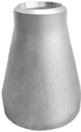
* Reference photo