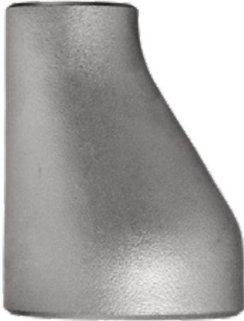
* Reference photo