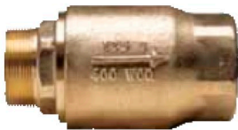
61-200 Male x Female Threaded 1/4" through 2"