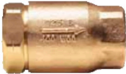
61-100 Female x Female Threaded 1/4" through 3"