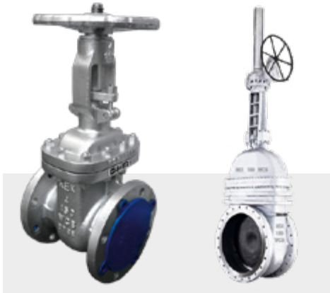
* Reference photo

Body and Bonnet Cast Steel ASTM A216 WCB Bolted Bonnet. Rising Stem OS&Y. Design, Manufacture, Test in accordance with API 600 Norm Steel Valves: ANSI/ASME B16.34 Flange dimensions: ANSI B16.5 RF Face to Face dimensions: ASME B16.10 Hydrostatic Testing API 598 From 16" optional gearbox operation