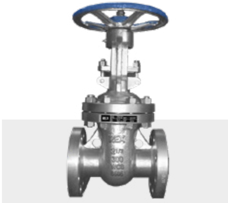
* Reference photo

Body and Bonnet Cast Steel ASTM A216 WCB Bolted Bonnet. Rising Stem OS&Y. Design, Manufacture, Test in accordance with API 600. Norm Steel Valves: ANSI/ASME B16.34 Flange dimensions: ANSI B16.5 RF Face to Face dimensions: ASME B16.10 Hydrostatic Testing API 598