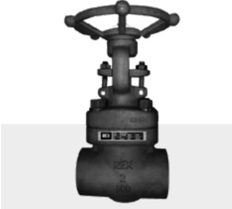
* Reference photo

Body and Bonnet Forged Steel ASTM A105 Bolted Bonnet. Rising Stem OS&Y. Design, Manufacture, Test in accordance with API 602 Norm to steel valves ASME B16.34 Ends weld (SW) ANSI/ASME B16.11 Face to Face dimensions: ASME B16.10 Hydrostatic Testing API 598