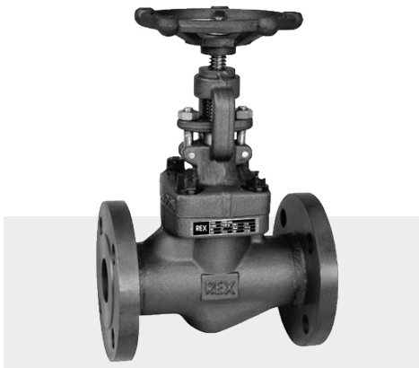
* Reference photo

Body and Bonnet Forged Steel A105 Bolted Bonnet. Rising Stem OS&Y. Design, Manufacture, Test in accordance with API 602 Norm to steel valves ASME B16.34 Flange dimensions: ANSI B16.5 RF Face to Face dimensions: ASME B16.10 Hydrostatic Testing API 598 * Certification pending to norm API 602 from American Petroleum Institute