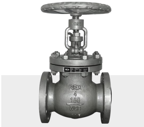
* Reference photo

Body and Bonnet Cast Steel A216 WCB Bolted Bonnet Rising Stem OS&Y Norm Steel Valves: ANSI/ASME B16.34 Flange dimensions: ANSI B16.5 RF Face to Face dimensions: ASME B16.10 Hydrostatic Testing API 598