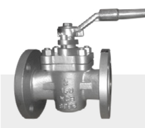
* Reference photo

Steel Body Type ASTM A216 WCB Plug: SS 316 (Optional SS 304) Seat: RPTFE Memoryseal seating technology Two pieces body. Full Passage Norm Steel Valves: ANSI/ASME B16.34 Flange dimensions: ANSI B16.5 RF Face to Face dimensions: ASME B16.10 Tests according to API 598