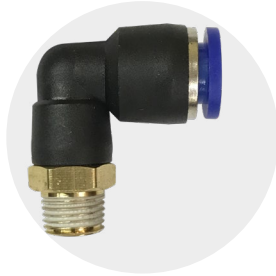
Includes air connector